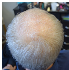
AFTER 1 BOTTLE