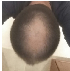
AFTER 6 WEEKS